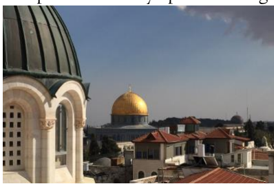
View of the Dome of the Rock from the Ecce Homo Convent

We enter the Old City early at 7:30 am in order to venture onto the holy ground of the Haram Al Sharif on the Temple Mount. By special arrangement, we visit the Al Aqsa Mosque and the Dome of the Rock with its golden