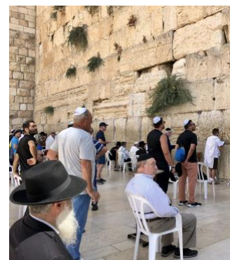
Praying at the Western Wall

Our day begins at the Jaffa Gate to walk atop the Old City walls built by Suleiman the Magnificent in 1538 A.D. for a bird's eye view of the Holy City. At the famed Damascus Gate, we descend and walk the Roman Cardo to the Church of the Holy Sepulchre. Inside we will unlock the beauty of Golgotha, the Empty Tomb and the architectural complexities of this most holy Christian site. We lunch in the Old City, and then we proceed to SS. James Armenian Orthodox Cathedral in the heart of the Armenian Quarter. We attend Vespers sung by the boys' choir and tour the only remaining walled quarter in Jerusalem. Before returning to the hotel, we will visit the Jewish Quarter and the Western Wall. The Western Wall is one of the exposed containment walls of the foundation platform needed to support Herod's Temple. Jews from around the world pray and worship here. Dinner, debrief and overnight at the Golden Walls Hotel.