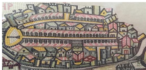
Byzantine Mosaic Map of Jerusalem in the 6 th Century AD

in Jerusalem. We lunch in Madaba, once a bustling Byzantine center. There, St. George's Orthodox Church contains the sole map of Byzantine Jerusalem with the Cardo, the Nea Church and Emperor Constantine's grand Church of the Holy Sepulchre all fully visible. Later we enjoy Mt. Nebo. Here, Moses gazed onto soft wind-blown hills of the Promised Land never to cross to the other side. We dine and spend the night in Amman.