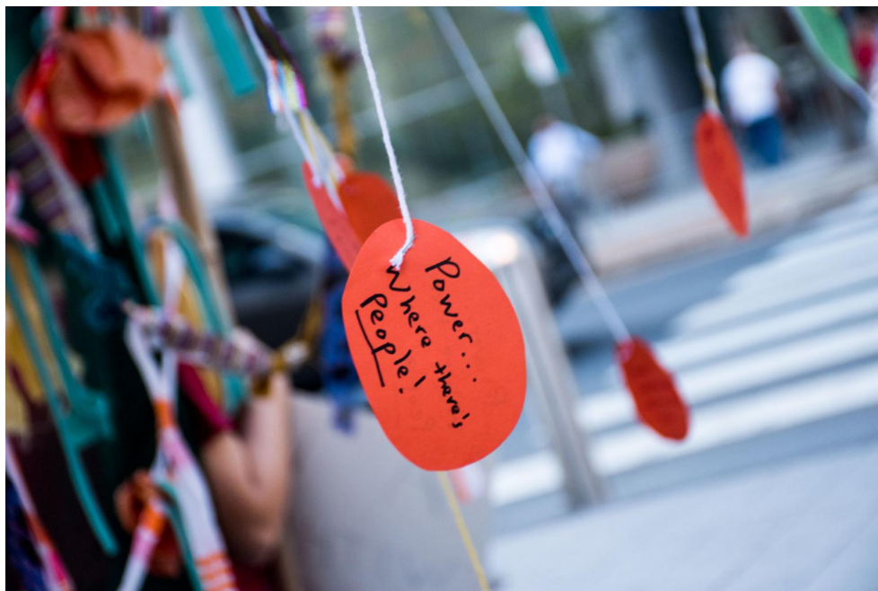
A commitment to peace: Jewish Voice for Peace's protest outside the International Association of Chiefs of Police annual conference last year.